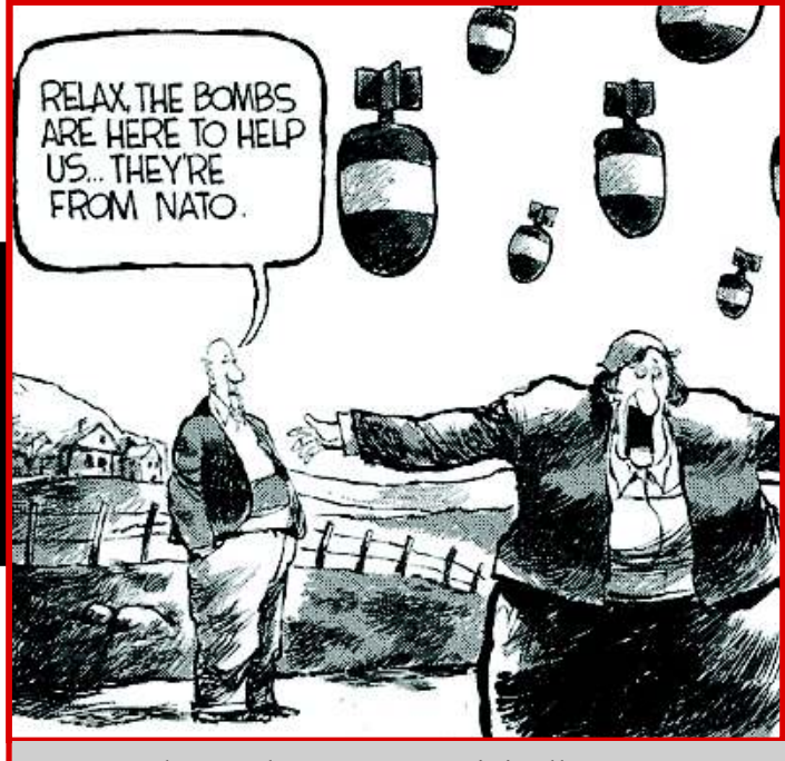
Cartoon by Cagle Cartoons, originally printed by the Ottawa Citizen

The specter of fascism is often invoked to give moral legitimacy to intervention, armed or