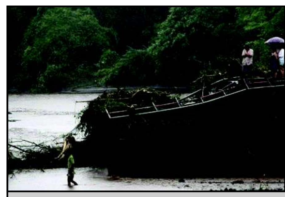
A bridge damaged by heavy rain in Quezalguaque, Nicaragua.

It has been raining for the entire period covered by this news summary. The La Niña weather phenomenon has to date resulted in a death toll of 54. Lake Managua is now higher than at the time of 1998's Hurricane Mitch. Massive crop losses threaten the progress made by the Ortega government in insuring food security. Throughout the country bridges and roads have been washed away and thousands of families have had to flee to higher ground. The Nicaragua Network has received numerous requests for aid. If you would like to contribute to flood relief and rebuilding, go to www. nicanet.org and click "donate". Page down to "pther" and enter "flood relief." You can also send a check to Nicaragua Network, 1247 E St., SE, Washington, DC 20003. Write "flood relief" in the memo line.