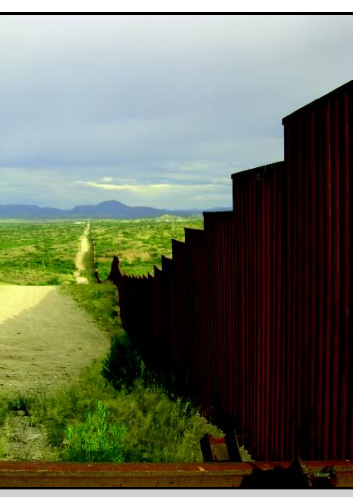
The border fence in Arizona comes to an abrupt end directly to the right of this photo.

During our board retreat last week in Tucson, Arizona, we attended a border tour guided by the Tucson-based group, Coalicion de Derechos Humanos.